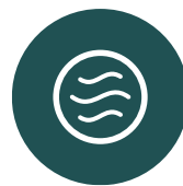
Marine growth prevention