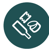
Dry waste treatment