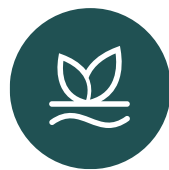
Wet waste treatment