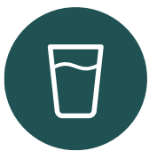
Fresh water generation